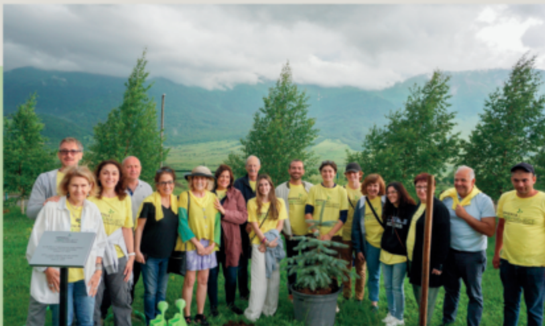
ATP Board Members, staff, and donors plant ATP's 7 millionth tree in Margahovit in June 2022